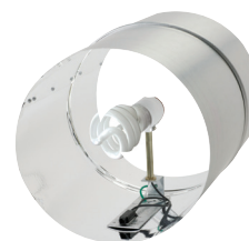
LED light kit