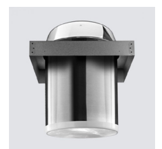
Open and closed ceiling configurations