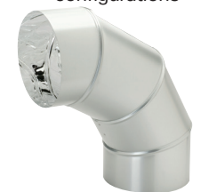
0-90 degree bend