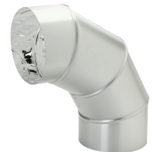
0-90 degree bend