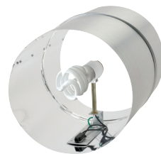
LED light kit