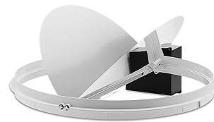
Solar daylight dimmer 0-10V dimmer