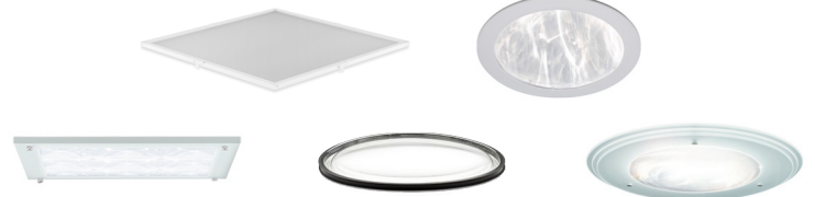
A variety of additional lenses, diffusers, square options and thermal panel