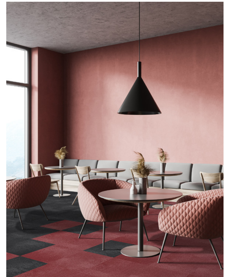
HAZE LP 306, LP 990