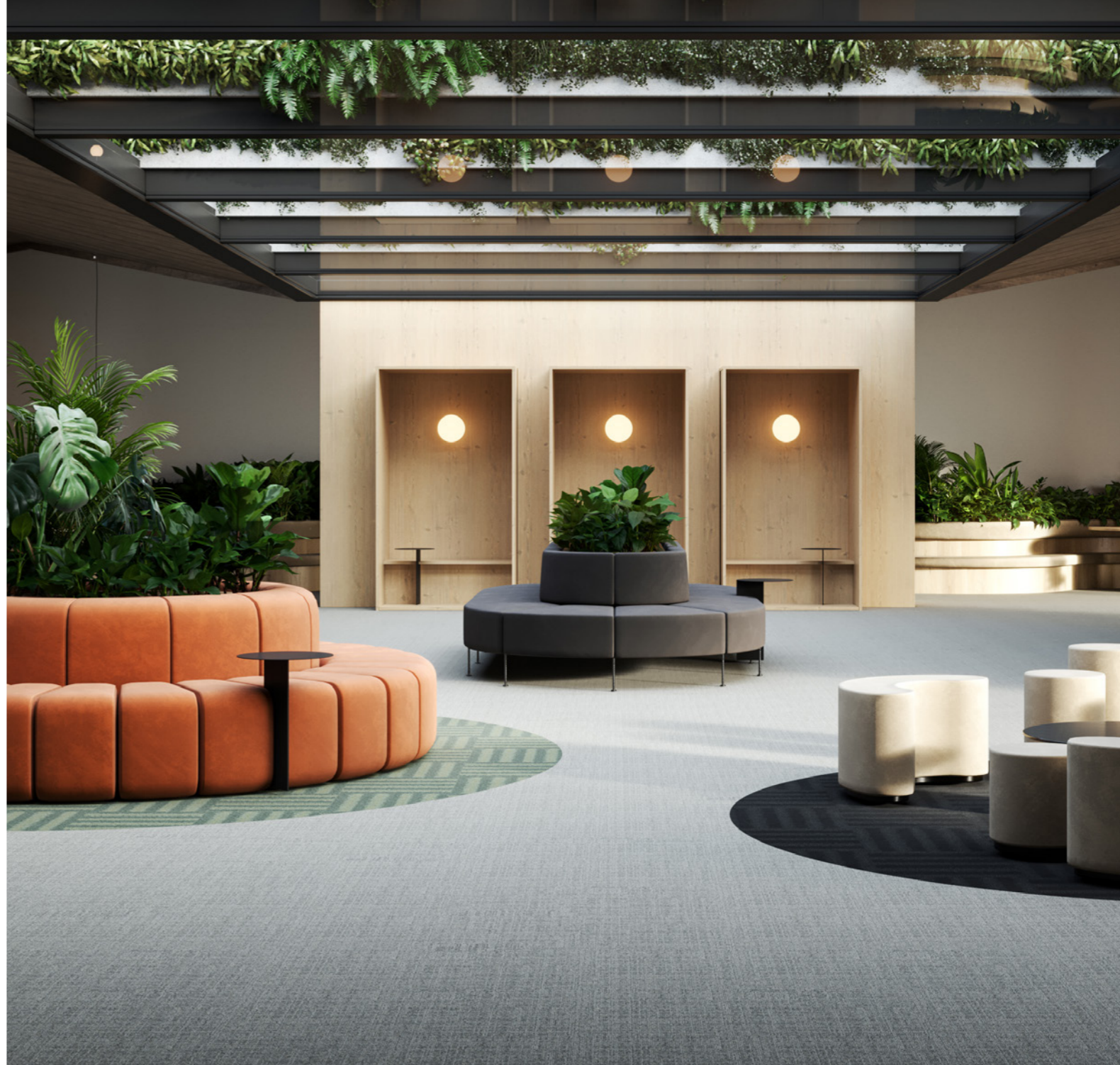
POLDER 683, 965, DUNE 901