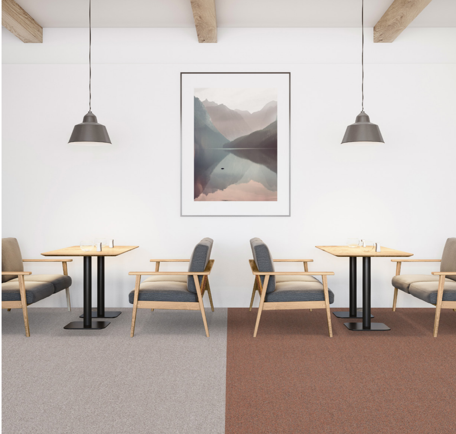
COBBLES 110, 324