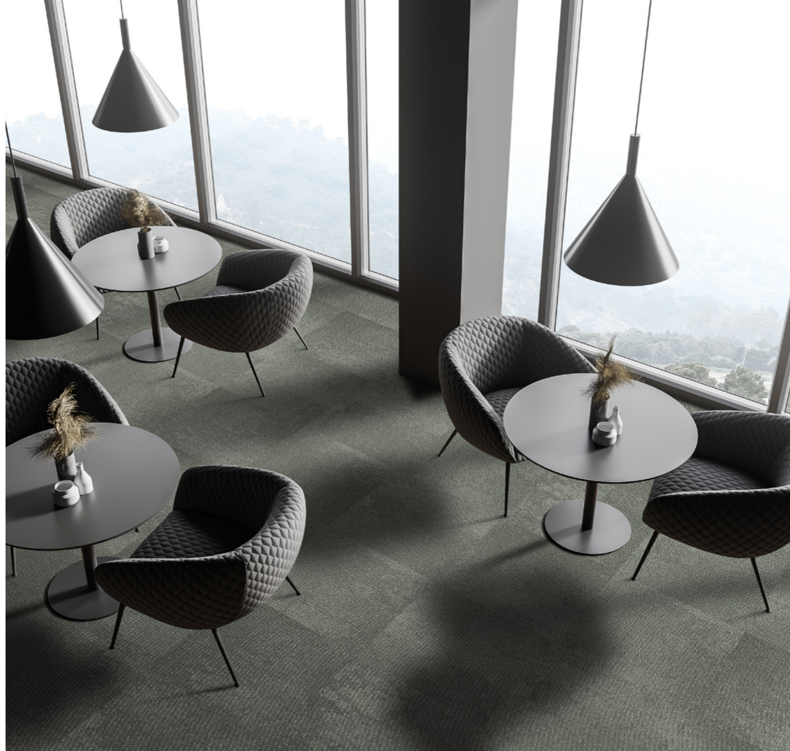
HAZE LP 850