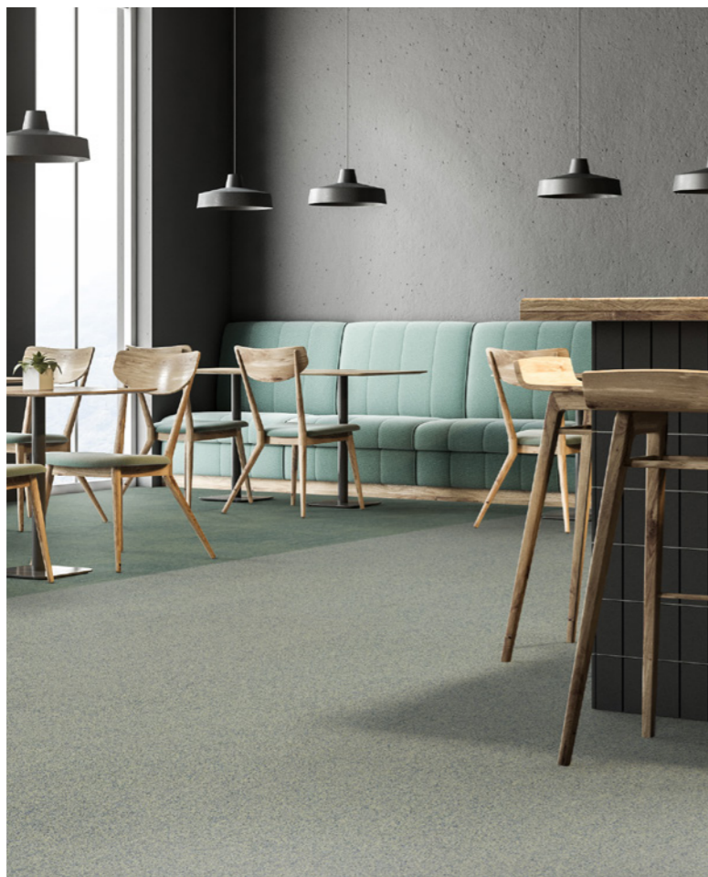
COBBLES 690, MEADOW 683