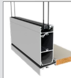
Magnum hinged door sill and rail (low threshold option).