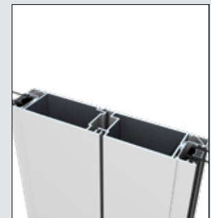
French door meeting stiles.