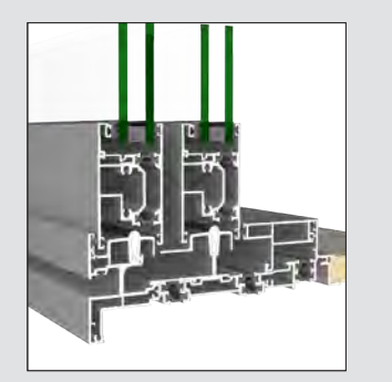
Multi slider sill frame.