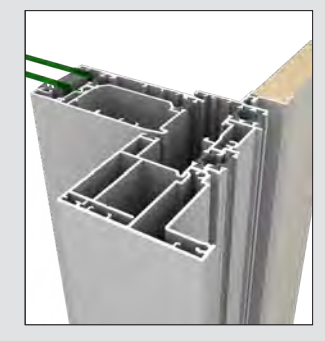
The sliding door jamb detail.