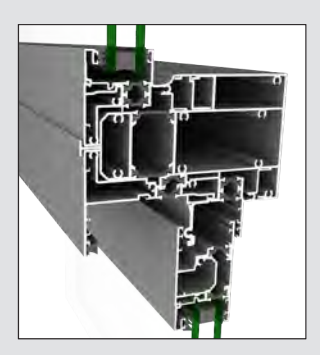
Door overlight coupling detail.