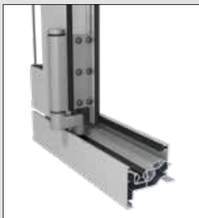
Sill track and panel roller.