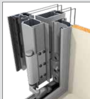
Lay-back fully open.