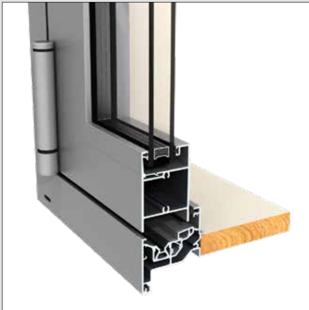
Sill frame and panel section.