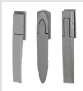
Urbo, Miro and Icon bi-fold handles.