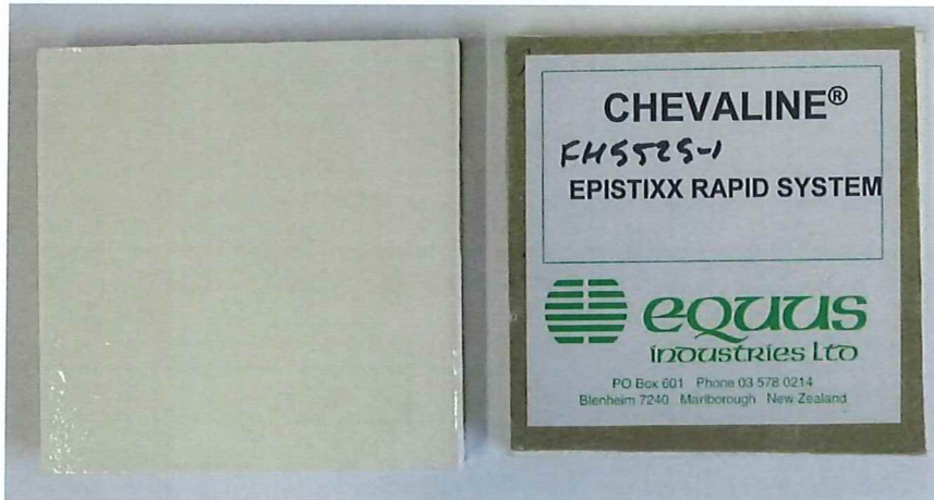
Figure 1: Representative specimen (front face on left, back on right)

The product submitted by the client for testing was identified by the client as Chevaline® Epistixx Rapid System on 10 mm standard paper-faced plasterboard. Figure 1 illustrates a representative specimen of that tested.