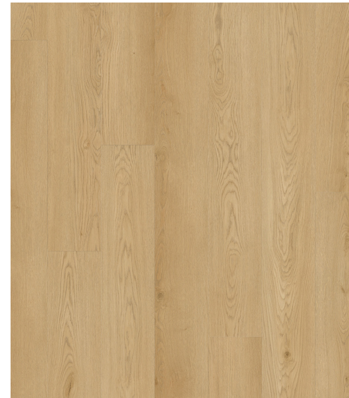
Honey Oak | 145