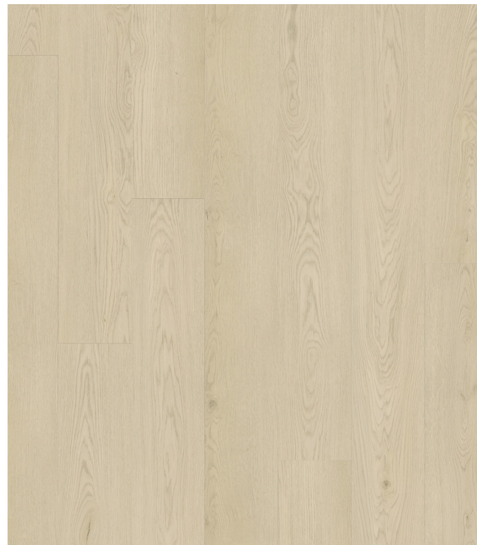
Chardonnay Oak | 105