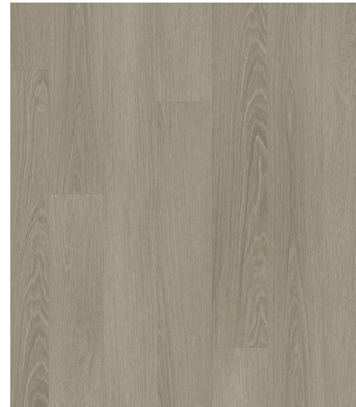
Limestone Oak | 115