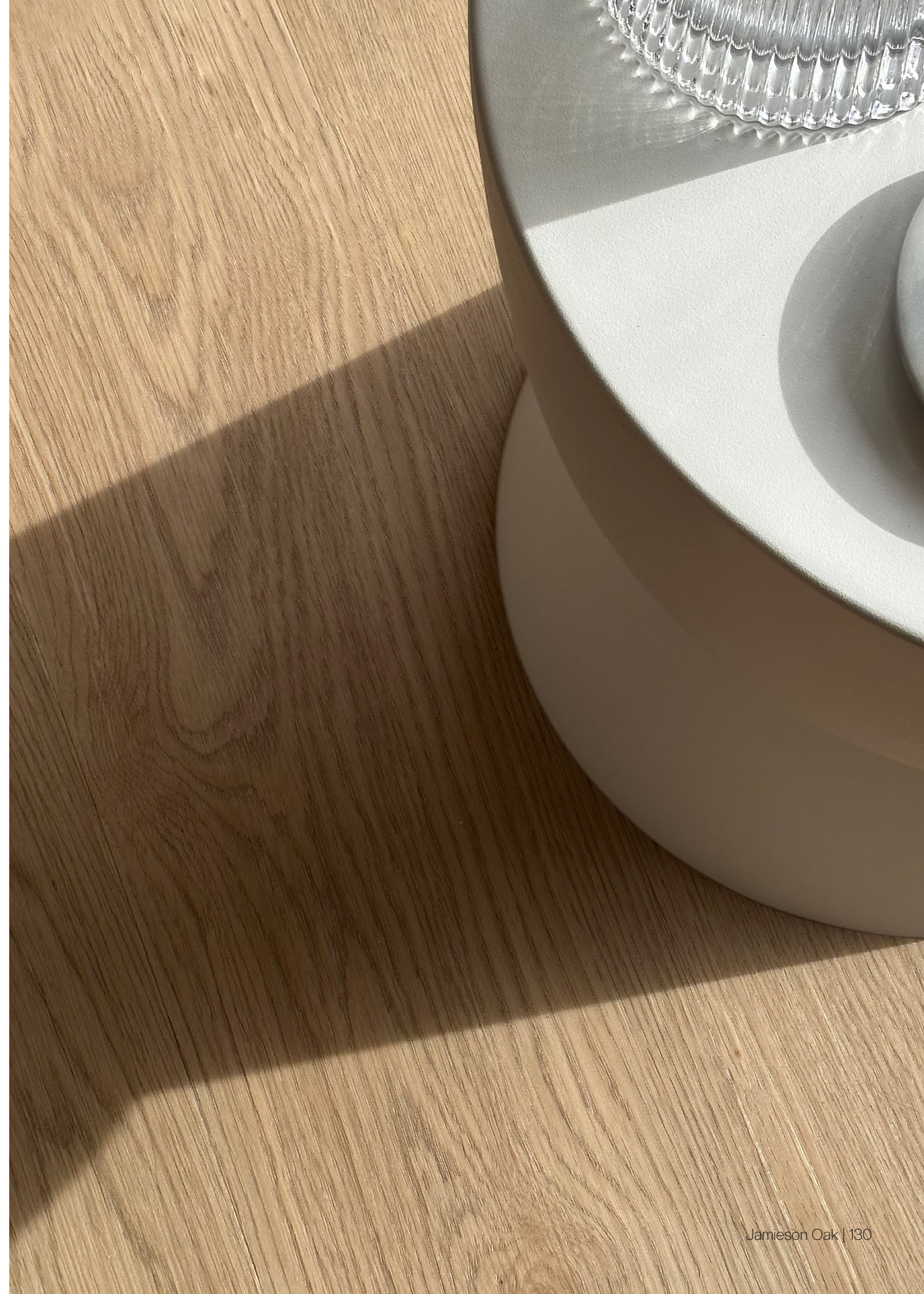
Jamieson Oak | 130