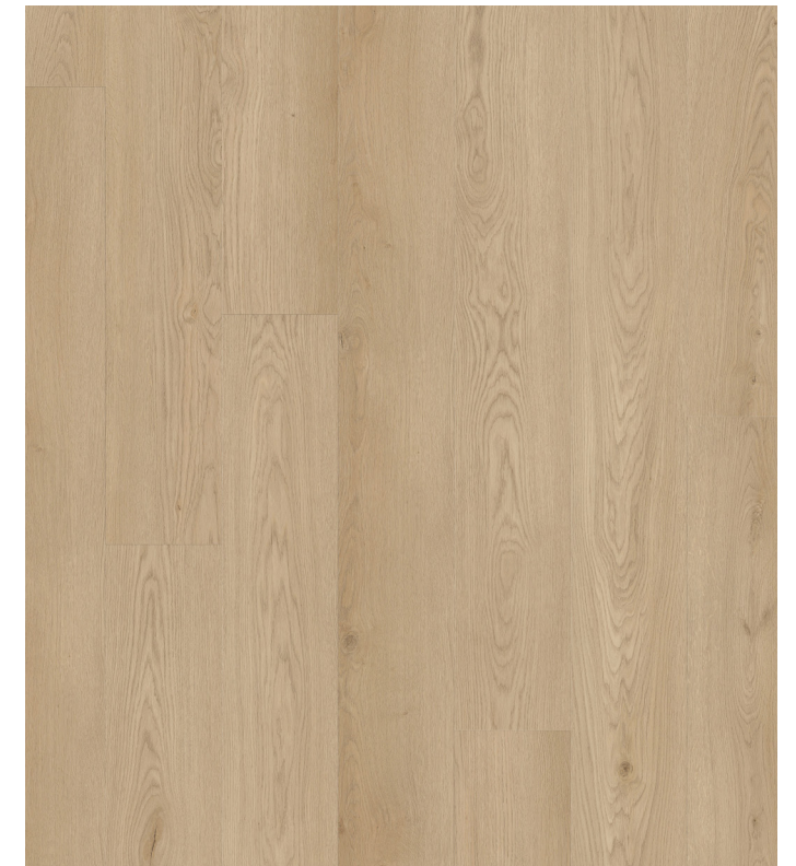
Jamieson Oak | 130