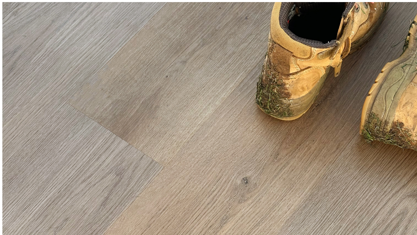
Malt Oak | 190