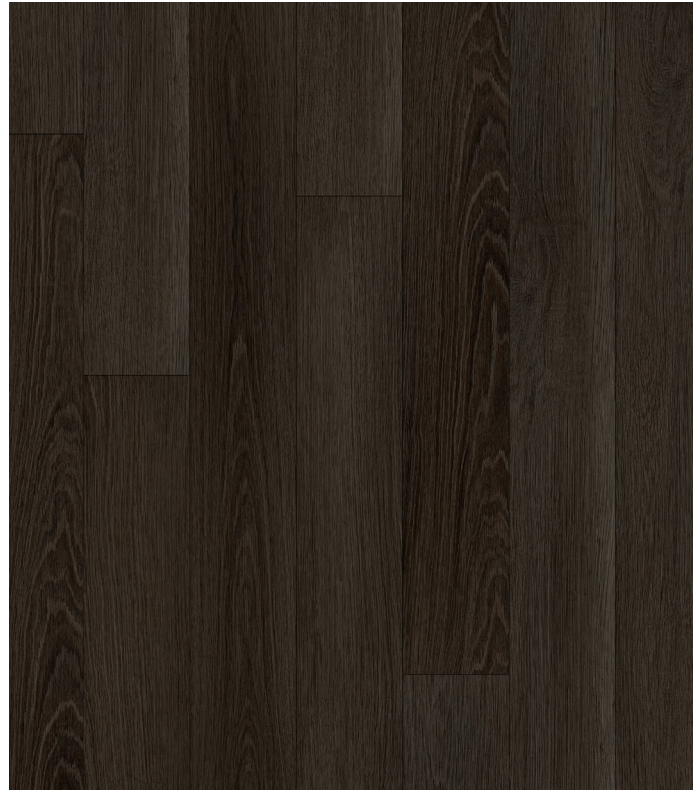
Cocoa Oak | 190