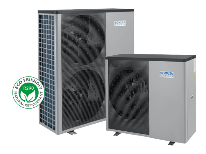
Domusa Dual Clima 16HT and 12HT