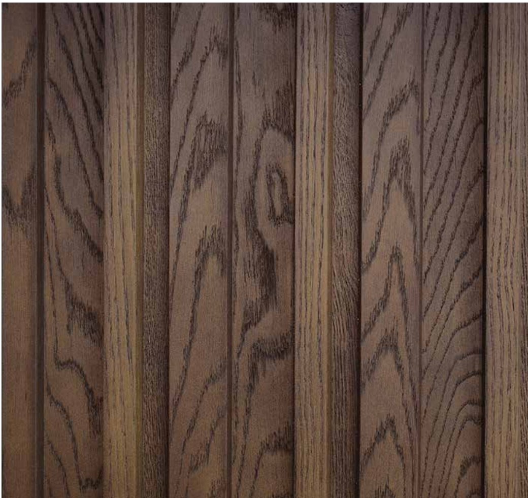
◀ Envello Board & Batten+ Antique Oak