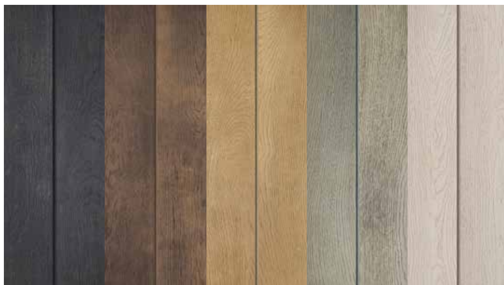
▲ Burnt Cedar Shadow Line+

The fire rating also includes the accessory items through a full system build-up, including the Reveal boards, Corner profiles and fixings. The formulation of the Shadow Line+ still continues the unique overall Millboard composition of a resin mineral mix, however has now been specially formulated to achieve the fire rating.