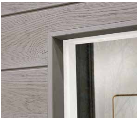
▲ Envello Shadow Line+ Smoked Oak

Corner Profiles and Fascia/Reveal Boards add distinction to corners of buildings, window and door reveals, soffits and much more. Our trims are specially selected to fit our profile, for a cleaner look and a faster, easier install.