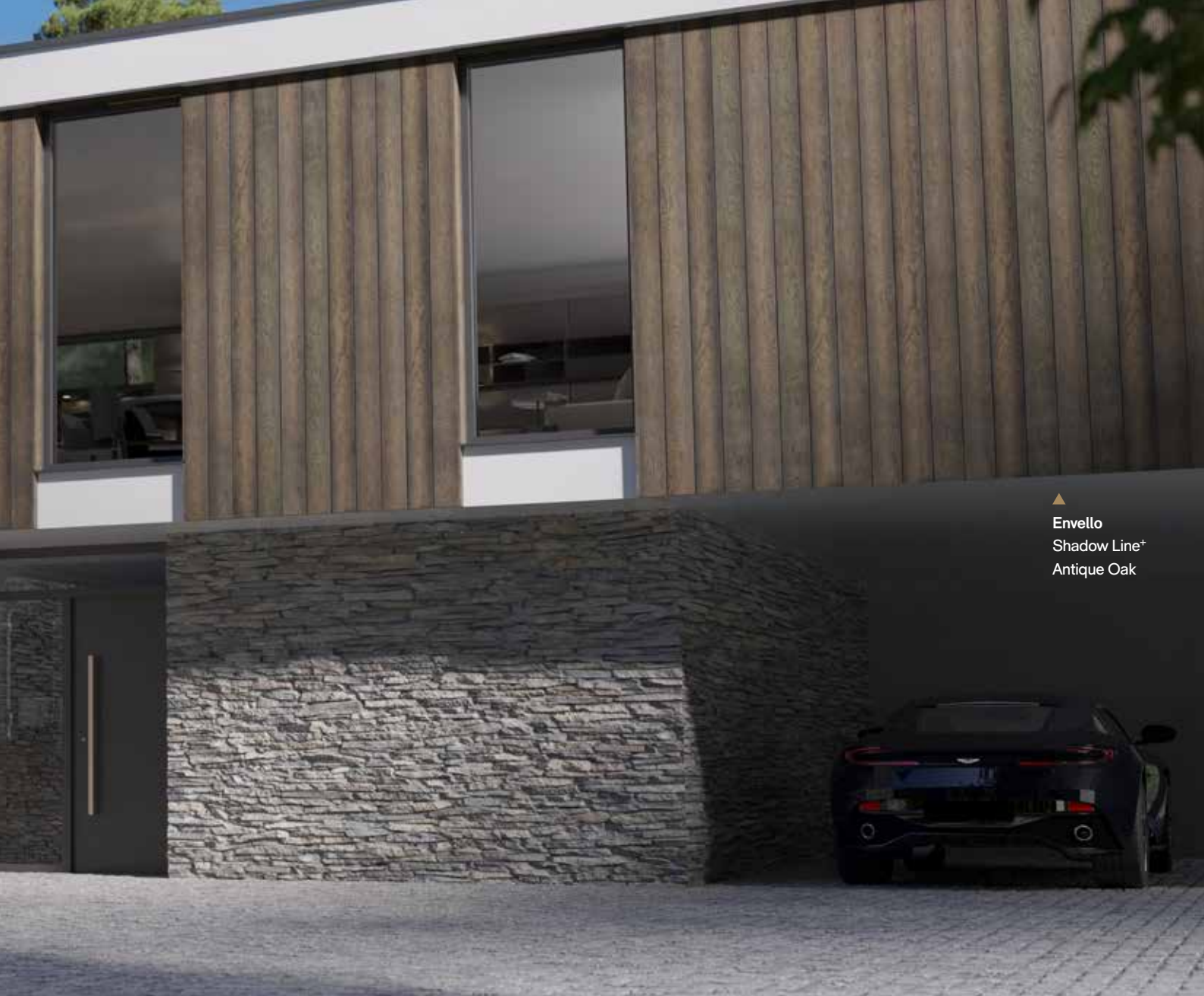
▲ Envello Shadow Line+ Antique Oak