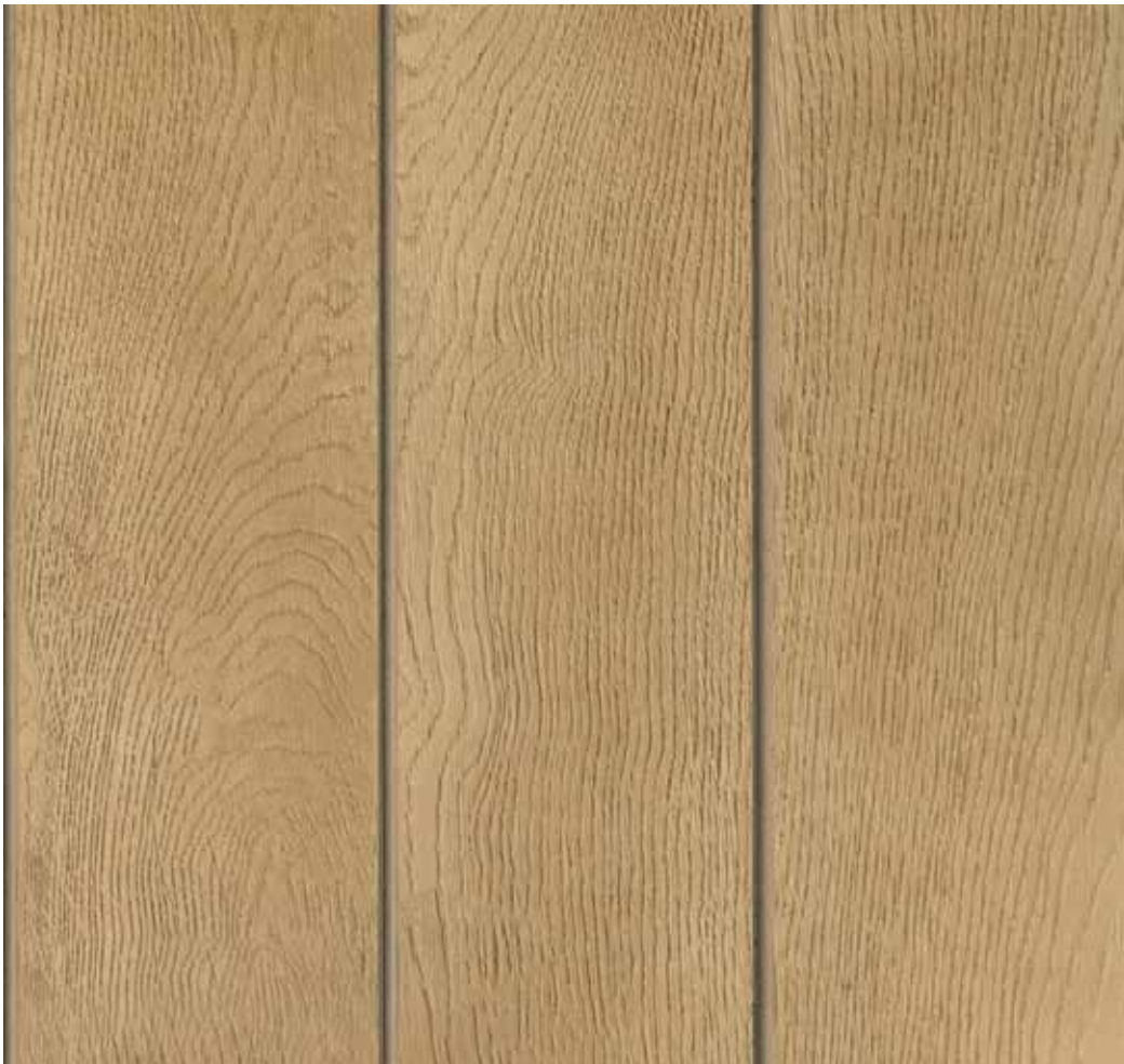
◀ Envello Shadow Line+ Golden Oak