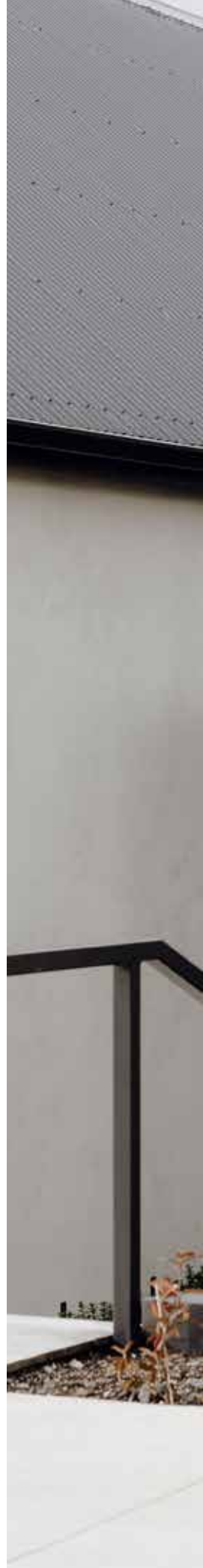
▲ Limed Oak Shadow Line+