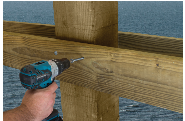
An ideal replacement for Coach Screws

Simpson Strong-Tie® Australia Pty Ltd Call 1300 STRONGTIE (1300 787 664) www.strongtie.com.au