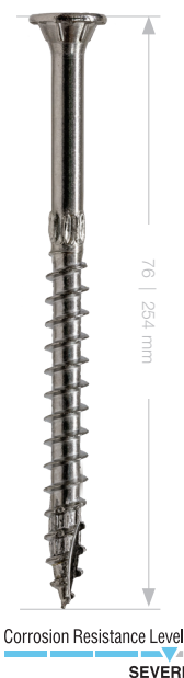
Table 1. Strong-Drive® SDWS Timber SS Screw Specifications