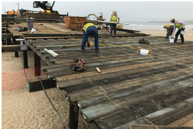
Docks, Pier's, Boardwalks, Jetty and Wharf construction