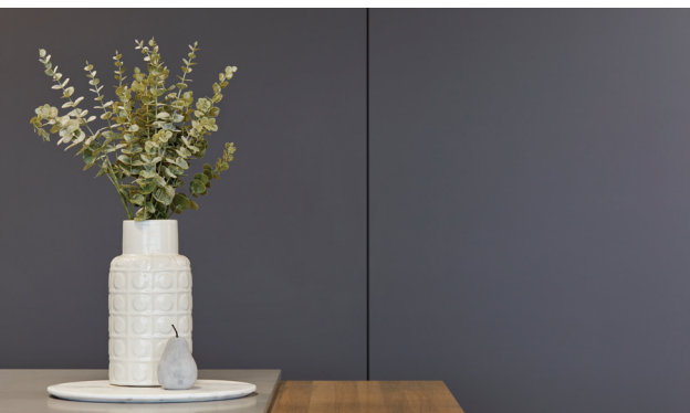
COLORSTEEL TidalDrift® Matte, Internal Insulated Panels, Pauanui