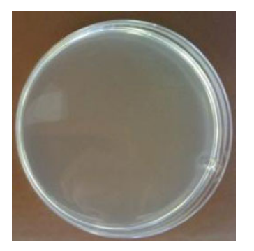
maiLaminate / maiCompact