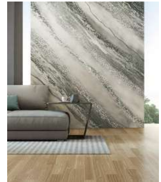
Image Modello Cracked Stone pattern with 1st coat of Bauta Silver and 2nd coat Ombra (tinted black)

Preparation Guide Refer Full Du Spec specification Sheet AUAC02681 Dulux Acratex Venetian Plaster Modello / Bauta / Ombra on New Plasterboard [Interior]