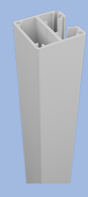
One Way Post START/END POST 50mm x 2400mm long