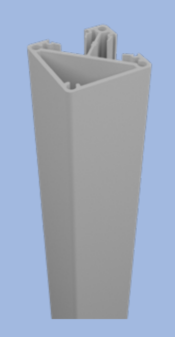
90° Post CORNER POST 50mm x 2400mm long