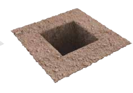
GROUND SET (WITH CONCRETE FILL)