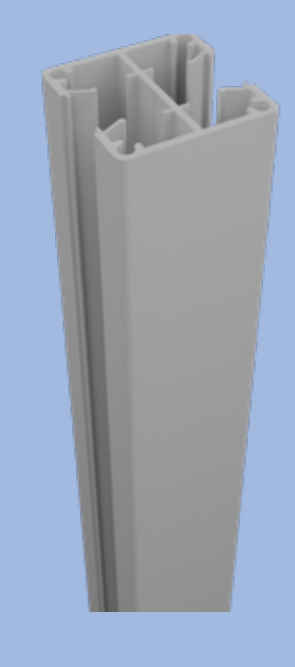
Two Way Post INTERMITTENT POST 50mm x 2400mm long