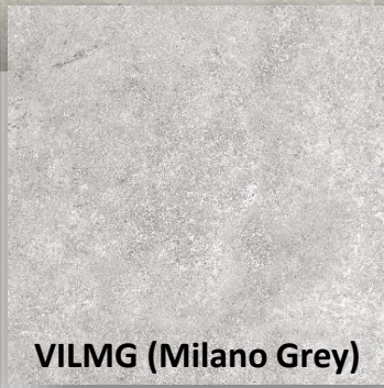
VILMG (Milano Grey)