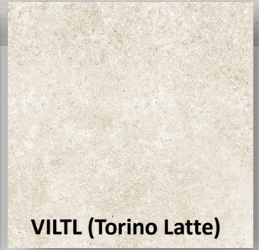
VILT (Torino Latte)