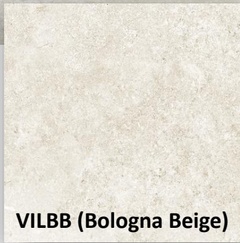
VILBB (Bologna Beige)