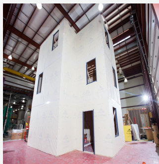
Trial 1: Building Wrap WRB-AB System