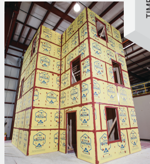
Trial 3: DensElement® Barrier System

The results presented reflect the findings on specific construction assemblies, under test conditions. Actual results may vary depending on the system, the building, the installation methods, and other factors.