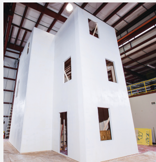
Trial 2: Fluid-Applied Membrane WRB-AB System