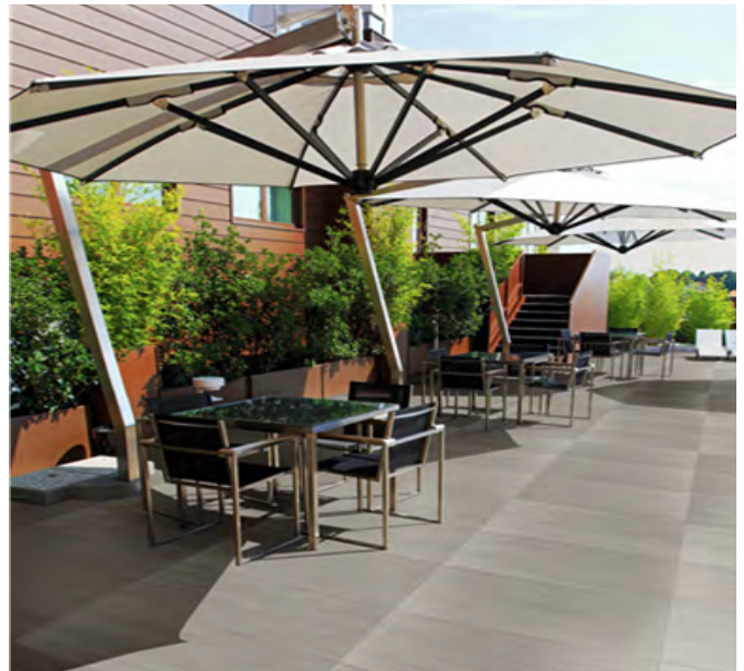
Figure 5 Installed product

The environmental burdens and benefits of obtaining secondary material from waste generated at the manufacturing stage (waste such as cardboard, plastic and wood), at the installation stage (tile waste, tile packaging waste: cardboard, plastic and wood) and at the end of life of the product have been considered.