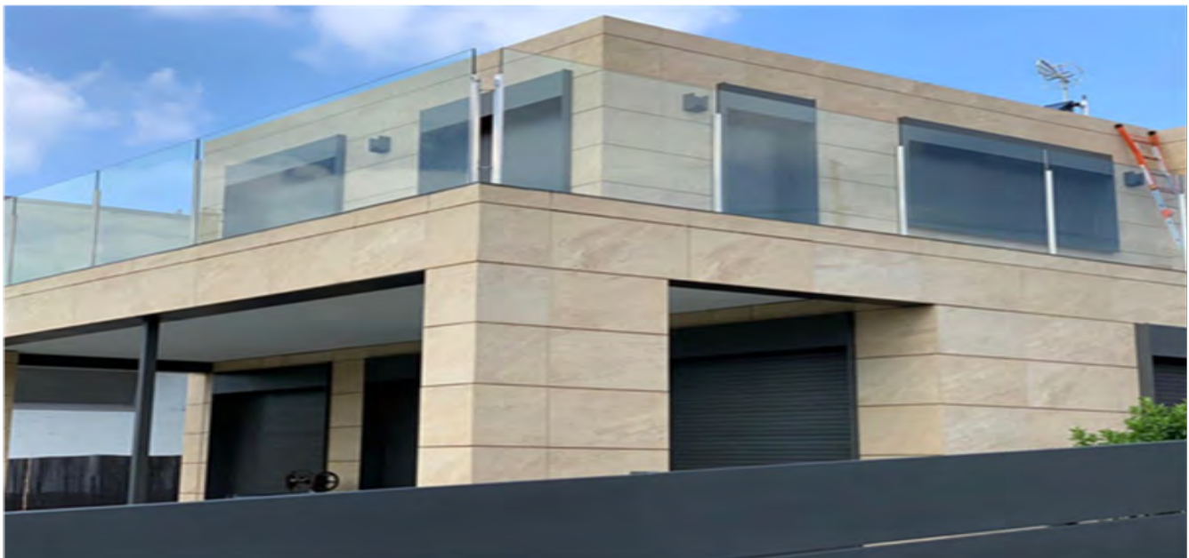
Figure 2 Installed product

The results of the sizes associated with the highest and lowest environmental impact show deviations of more than 10% from the weighted average. Annexes I and II show the environmental impact results of the reference with minimum and maximum impact values respectively.