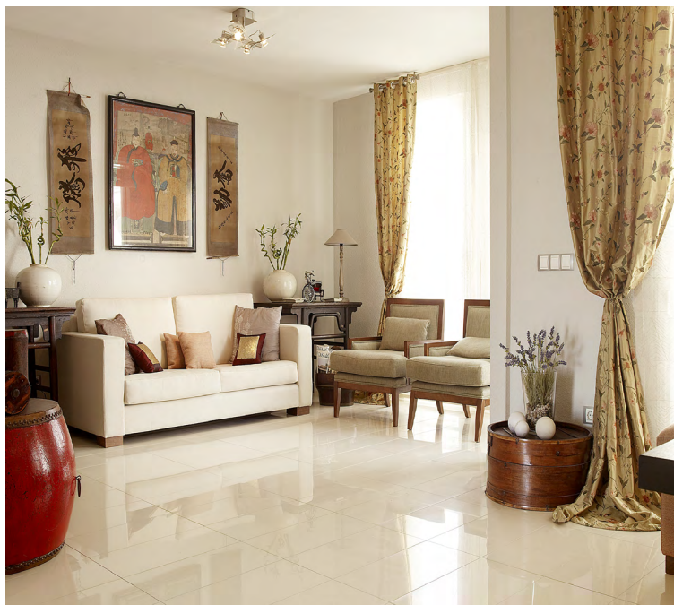
Figure 4 Installed product

The waste derived from the packaging of the pieces is managed separately according to the geographical location of the installation site. Otherwise, 3% of product losses have been considered at the installation stage.