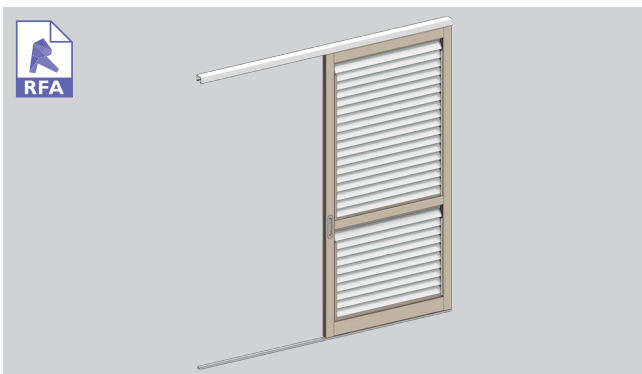
COASTAL 80 BOTTOM ROLLING SLIDING SHUTTER