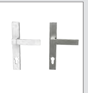
Urbo and Icon lever locks.