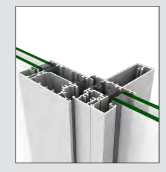
Hinged door and sidelight on right.