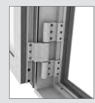
Door hinge in open position.