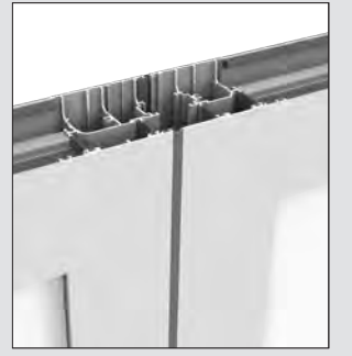
French door meeting stiles.